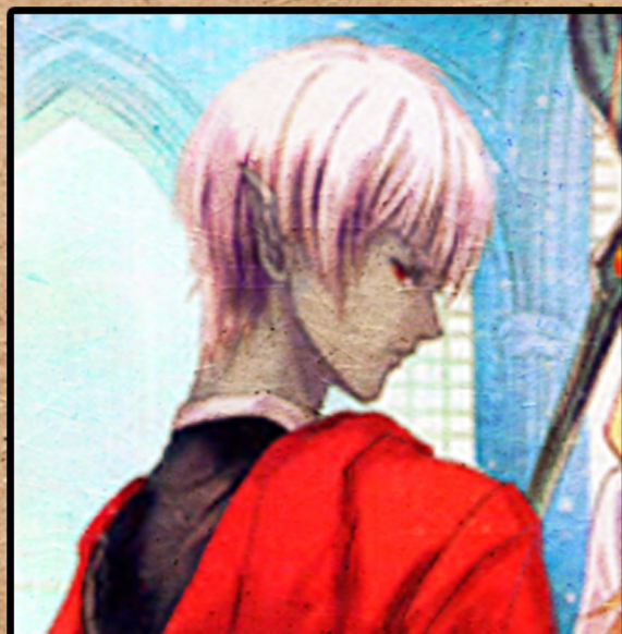
ALDRIZZT RENEGADE DARK ELF