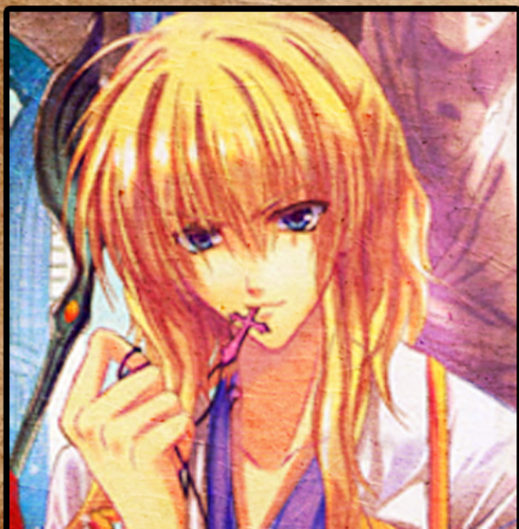
NEO SUN STRONGEST SUN KNIGHT IN HISTORY